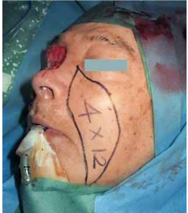
Fig 2 A retroangular island flap is outlined in the contralateral orbitonasolabial region.