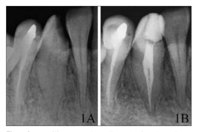
Fig 1 Case 1: (A) preoperative radiograph of tooth 43 shows two root canals; (B) final obturation of the root canals using cold lateral condensation.