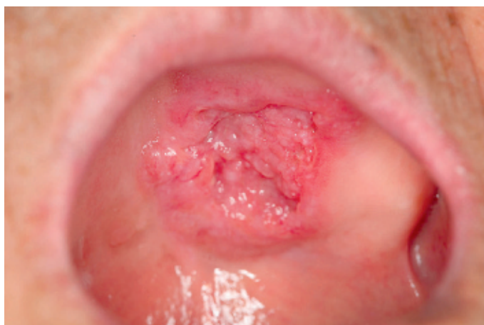
Fig 1 A large, deep, red, mucosal ulceration was present in the posterior hard palate at the junction of hard-soft palate.