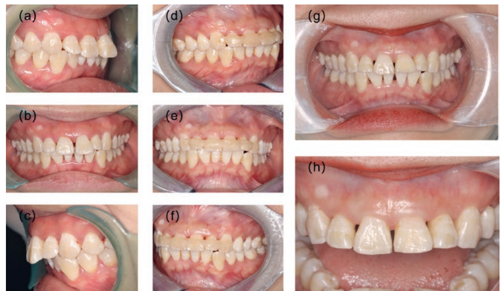
Fig 3 Pre- and postoperative intraoral photographs. Preoperative intraoral photographs (a to c). Intraoral photographs taken 6 months postoperatively (d to f). Intraoral photographs of periodontal splints removed 5 years after surgery (g and h).

odontal indexes after treatment. Imaging data showed a significant increase in alveolar bone height and density. The present study suggested that dental implant system-assisted IR is an effective solution for preserving natural teeth in situations with PHT that have loosened and drifted as a result of stage III/IV periodontitis.